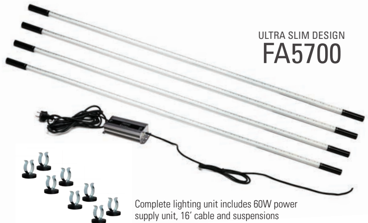
ULTRA SLIM DESIGN FA5700

Complete lighting unit includes 60W power supply unit, 16' cable and suspensions