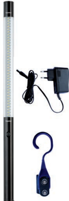
ULTRA SLIM DESIGN FA5702

ORDER NOW AND LIGHT YOUR WAY TO GREATER PRODUCTIVITY AND PROFIT!