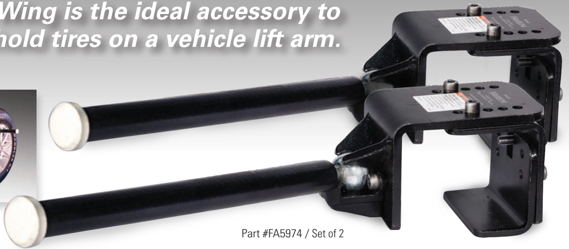
Part #FA5974 / Set of 2

Avoid back strain when bending to put down or pick up a tire.